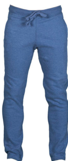
MELANGE LIGHT DENIM