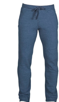
MELANGE DENIM BLUE