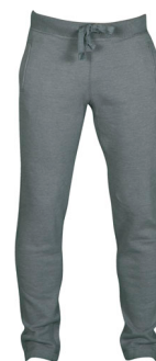
MELANGE STEEL GREY